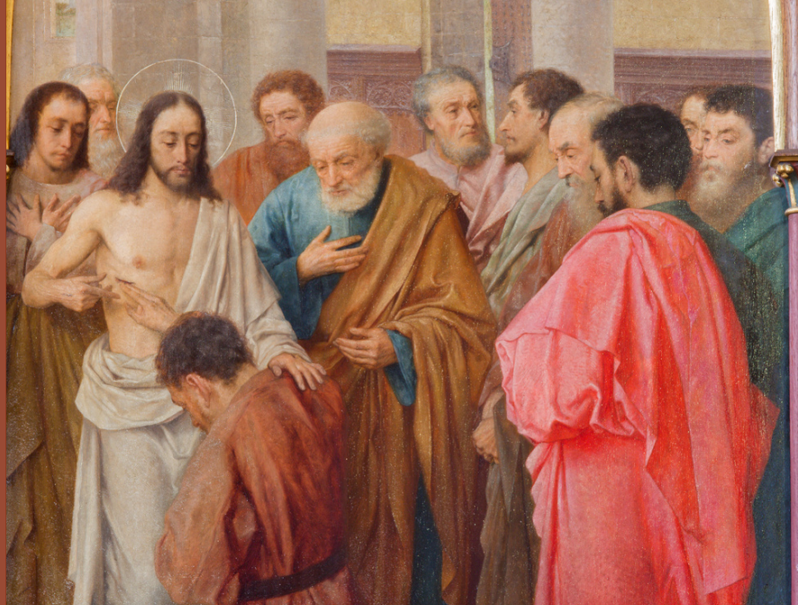
Jean-Léon Gérôme, Public domain, via Wikimedia Commons