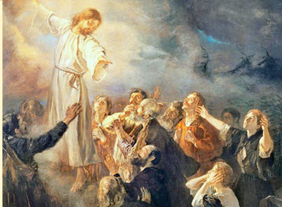
The Ascension of Christ, Fritz von Uhde

“Go out to the whole world; proclaim the Good News to all creation.”