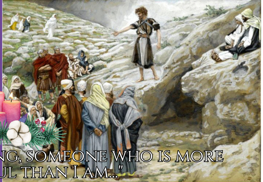
James Tissot

"...SOMEONE IS COMING, SOMEONE WHO IS MORE POWERFUL THAN I AM..."