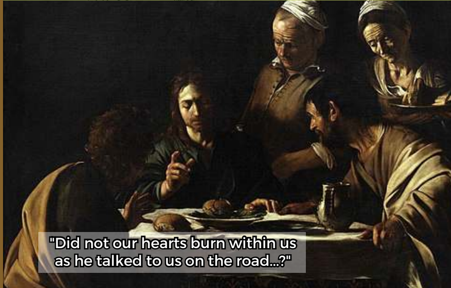
Caravaggio, Public domain, via Wikimedia Commons